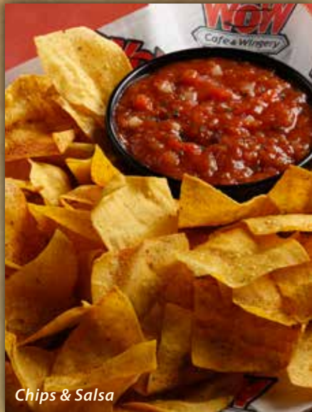
Chips & Salsa